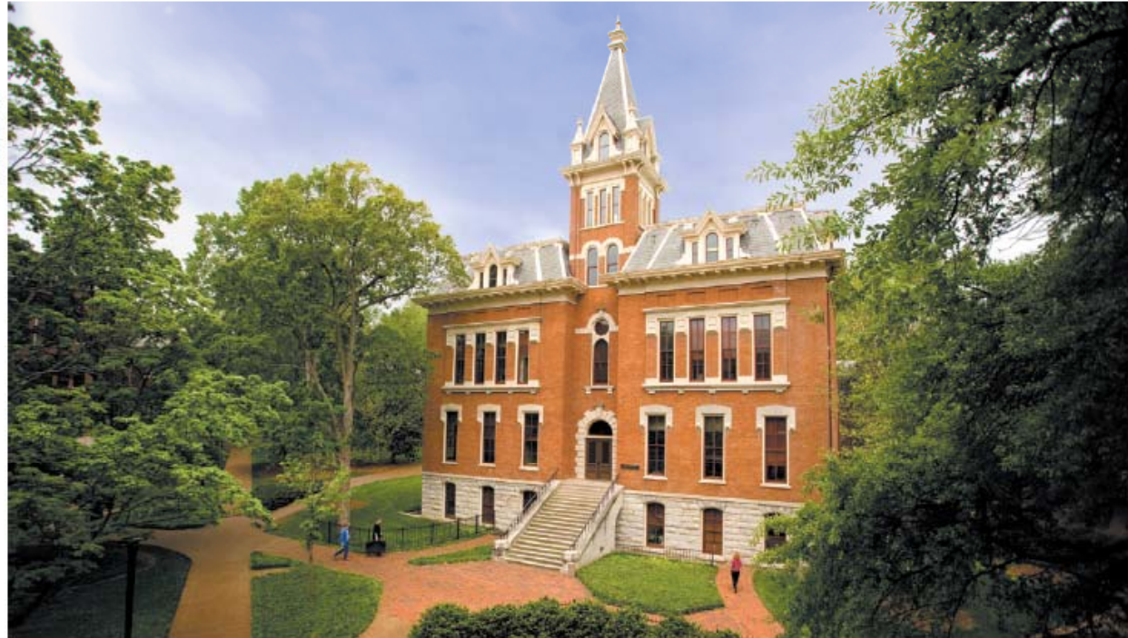
Vanderbilt University, Tennessee, is the leading US producer of minority graduates with PhDs in astronomy, physics and materials science.